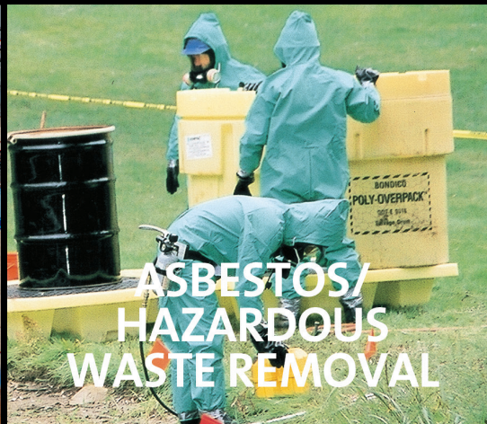
ASBESTOS/ HAZARDOUS WASTE REMOVAL